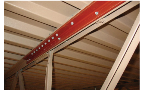
FIGURE 5 Original top chord strengthened with a new screw-fastened steel angle