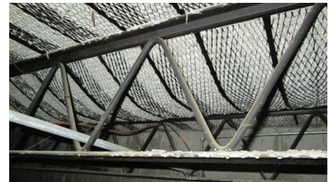
FIGURE 1 Photograph of an open web steel joist circa 1930

Similar to most existing structural components or systems, the load carrying capacities of existing open web steel joists can be estimated; however, the reliability of any such assessment can be affected by a variety of factors. The capacity of existing open web steel joists can be determined with the greatest confidence when the original design, construction, or shop drawings are available. When these