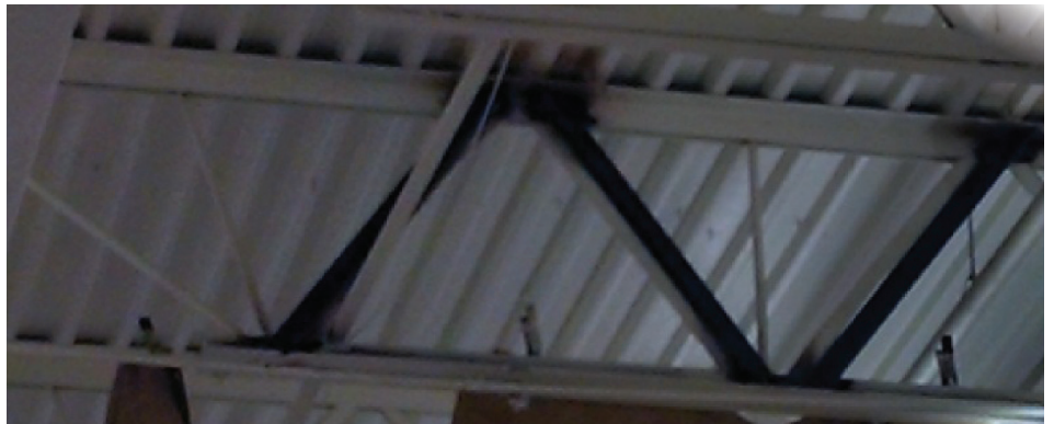
FIGURE 6 Original web members supplemented with new steel angles