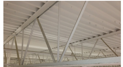
FIGURE 2 Photograph of a modern open web steel joist