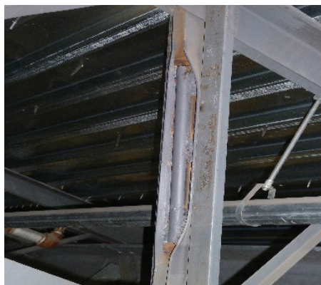
FIGURE 7 Original web member strengthened with new steel rod and angles.