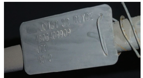
FIGURE 3 Typical joist tag

documents cannot be obtained, the next best option is to see if joist tags are still in place on the affected joists. A joist tag is a metal label wired to each joist during fabrication that provides information such as the manufacturer's name, job number, mark number, plant location, and date; an example is shown in Figure 3. When joist tags can be retrieved, it is likely that the manufacturer can be identified who