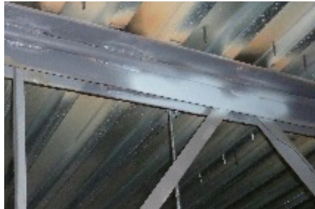
FIGURE 4 Original top chord strengthened with new welded steel rod

Once the capacities of the existing joists are known within a reasonable degree of engineering certainty, they can be compared to the proposed demands to determine if the new loads can be carried with an adequate factor of safety. When the answer to this question is no, there are