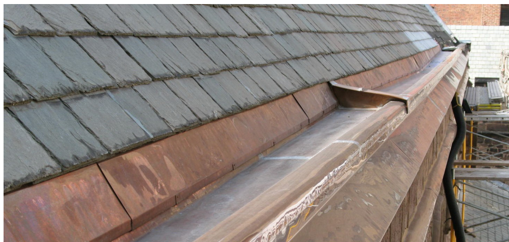
FIGURE 1 A typical copper built-in gutter liner with an expansion joint at its high point

WJE ENGINEERS ARCHITECTS MATERIALS SCIENTISTS Wiss, Janney, Elstner Associates, Inc.