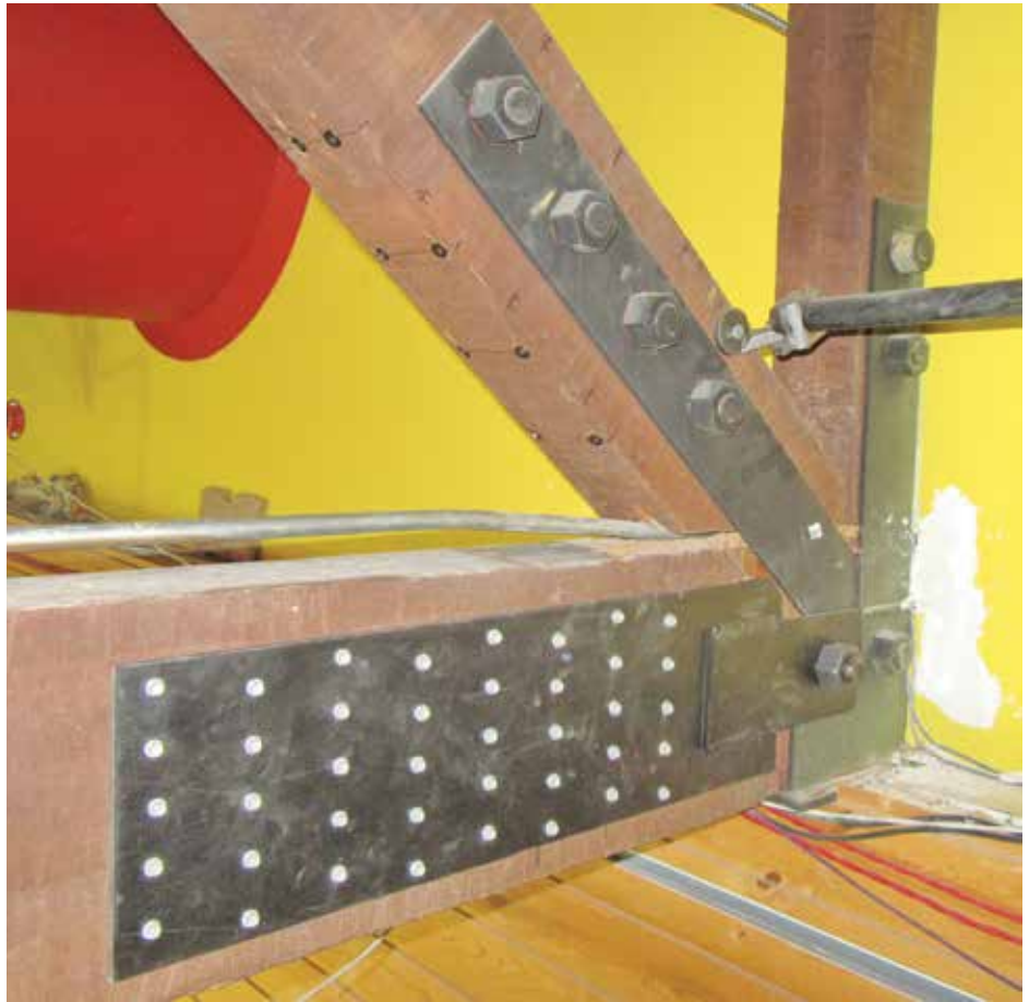
New heel plate connection at the bottom chord and supplemental HeadLOKs installed on the diagonal bottom surface.

together. The capacity of wood to resist tension perpendicular to grain is so low that there are no allowable design values. Assuming allowable tension perpendicular grain stress is equal to allowable radial tension stress to represent capacity, the analysis shows the supplemental HeadLOK more than doubled or tripled, depending on location, the ability to resist tension perpendicular-to-grain splitting in the plane of the bolts.