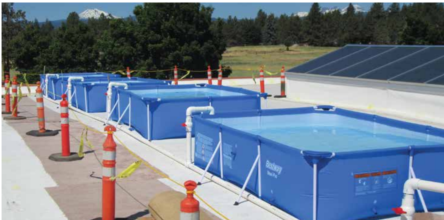
Pools filled with water on the roof during load test of the repaired truss.

to be equal to the snow load (30,453 pounds) plus removed ceiling tiles and their metal support grid (1,493 pounds) minus the pool self-weight (215 pounds). The total weight of the created load was 31,731 pounds, which equates to 3,805 gallons of water.