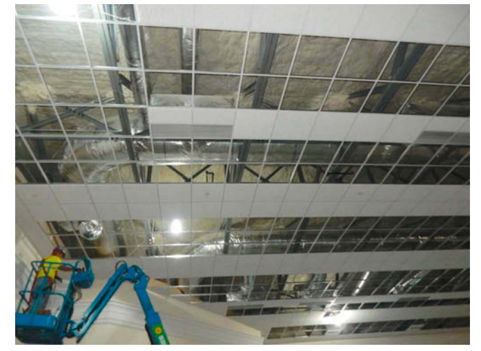
Ceiling reinstallation without the fiberglass insulation.