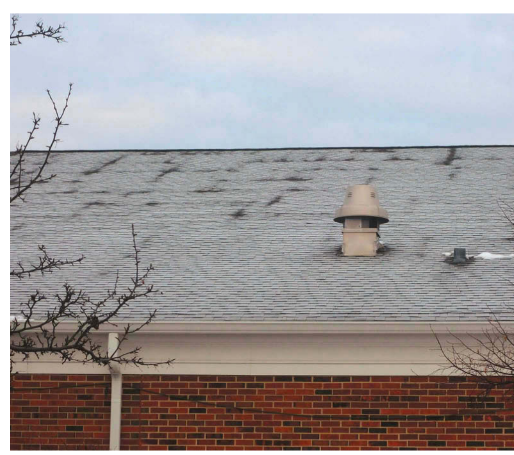
Patterns of frost-melt on roof surface.

The asphalt shingle roofing, which was only 16 years old, had been replaced in 2012, about two years prior to our inspection. The replacement work included new flashing, underlayment, ice-and-water shield, and roof-vent modifications to supplement original. The repairs retained the ventilated panels and a continuous ridge vent. The contractor also added vents along the bottom of