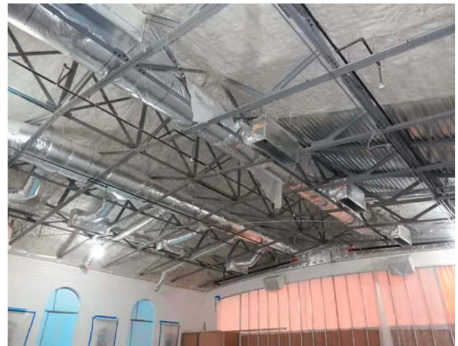
32 | Licensed Architect | Summer 2017