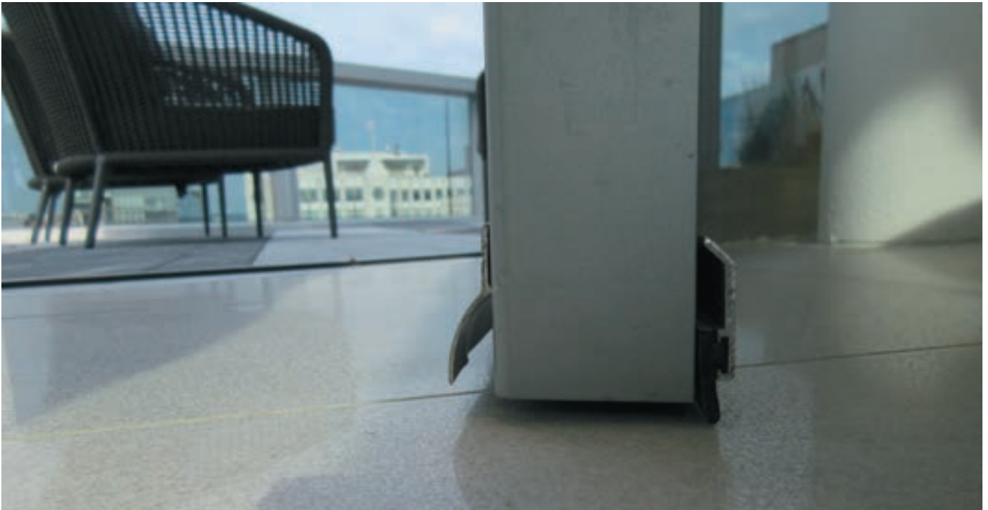
Figure 9. Door accessories mounted to the base of a terrace door panel. There are multiple sizes and styles of surface-mounted diverters and sweeps on the market that range in color and material.