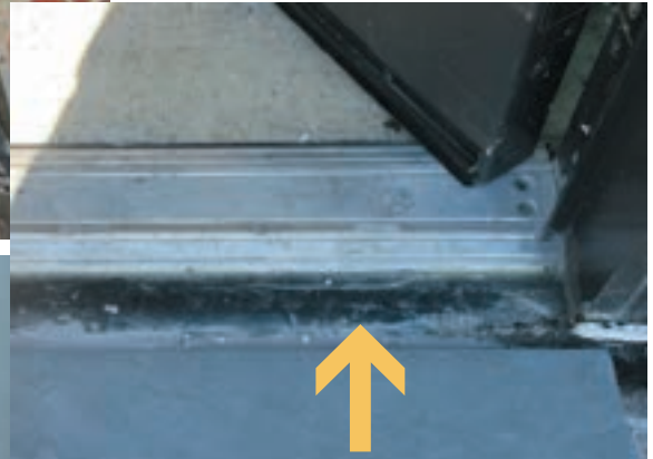
Figure 7. Exposed terrace waterproofing outboard of threshold is not designed for exposure to ultraviolet light and direct foot traffic.