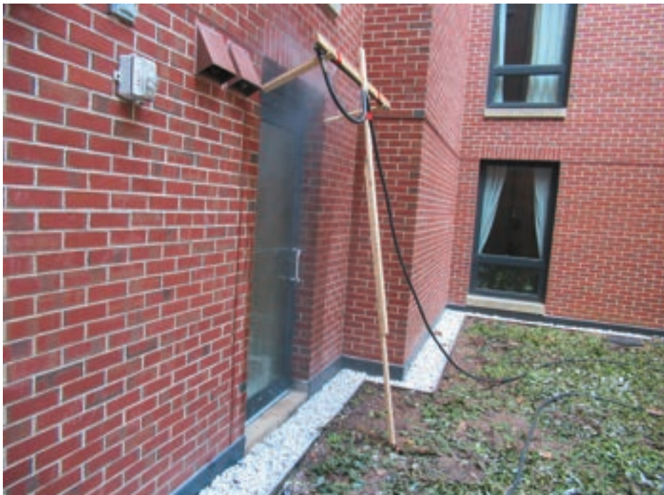
Figure 1. ASTM E1105 spray rack assembly positioned above the head of a terrace door, allowing water to sheet over the door assembly at zero pressure differential.

terrace door assembly. Applicable building codes must be consulted to determine accessibility and egress requirements. Accessibility and egress requirements have a direct impact on water management capabilities of the door assembly.