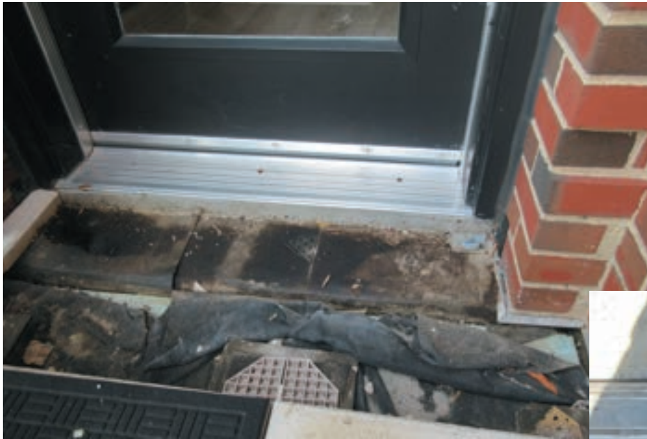
Figure 6. A door with a threshold that meets Americans with Disabilities Act requirements set atop concrete infill at a terrace. Waterproofing on terrace beneath pedestal pavers was not extended up and onto the concrete fill prior to placement of the threshold. In addition, threshold is not bed sealed.