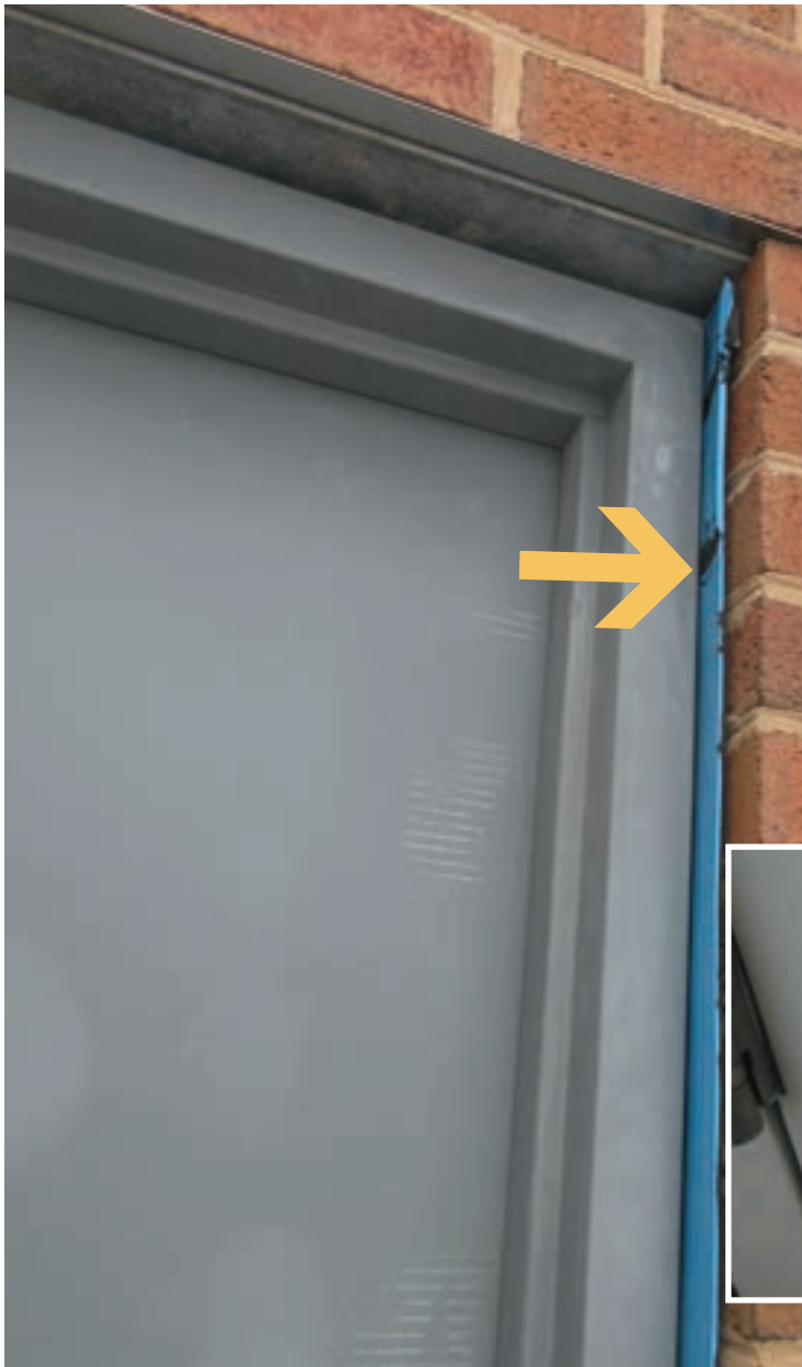
Figure 2. Vertical masonry cavity closure flashing installed at the jamb of a terrace door to provide a substrate for the perimeter sealant.

Perhaps the most definitive element in determining the performance of in-swinging terrace doors with regard to water penetration is the threshold (Fig. 4 and 5). Typically, the water resistance performance of door thresholds can be improved by increasing the threshold height. However, as stated previously, the vertical height