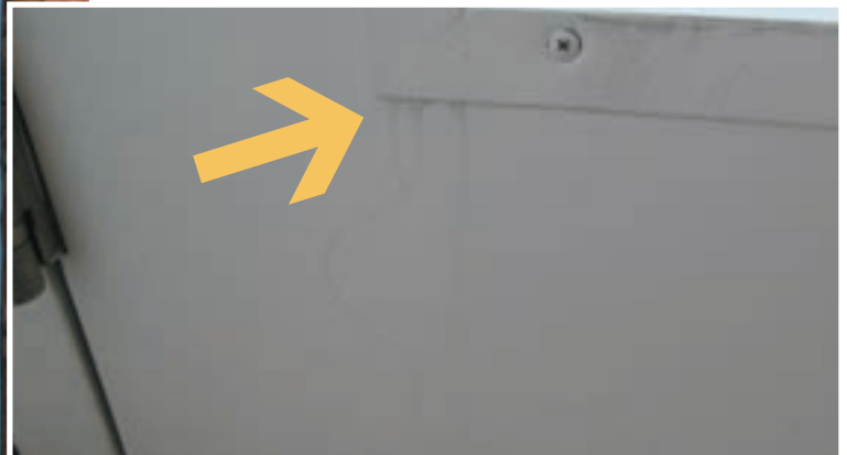
Figure 3. Active leak at the lower corner of a glazing unit installed within a terrace door assembly.