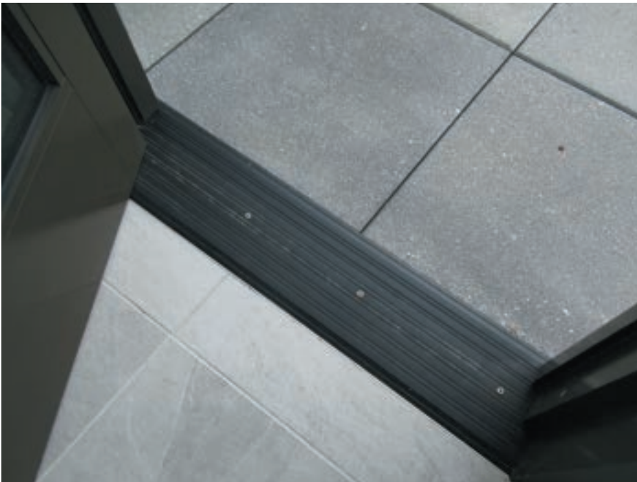
Figure 5. Flat door threshold, meeting Americans with Disabilities Act requirements, with no gasketing.

is limited on accessible swing doors to ½ in. (13 mm) by ADA. There are numerous sizes and shapes to thresholds, including, but not limited to, flat, saddles, half saddles, offset saddles, and latching panic saddles. Designers may select a certain threshold profile to aid in covering an exterior waterproofing or cavity condition or to transition onto an adjacent hardscape. These elongated flat profiles can promote lateral migration of water under the door panel.