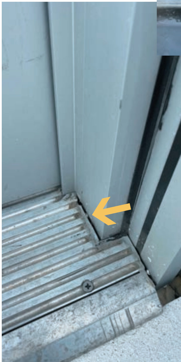
Figure 8. Door threshold is notched around frame at the jambs and is not sealed to the door frame. There is potential for water ingress at the joint between the jamb and threshold. Additionally, the presence of door pivot boxes, unsealed or erroneous fastener penetrations through the threshold, and/or discontinuous waterproofing beneath the threshold can all lead to water entry under a door threshold.