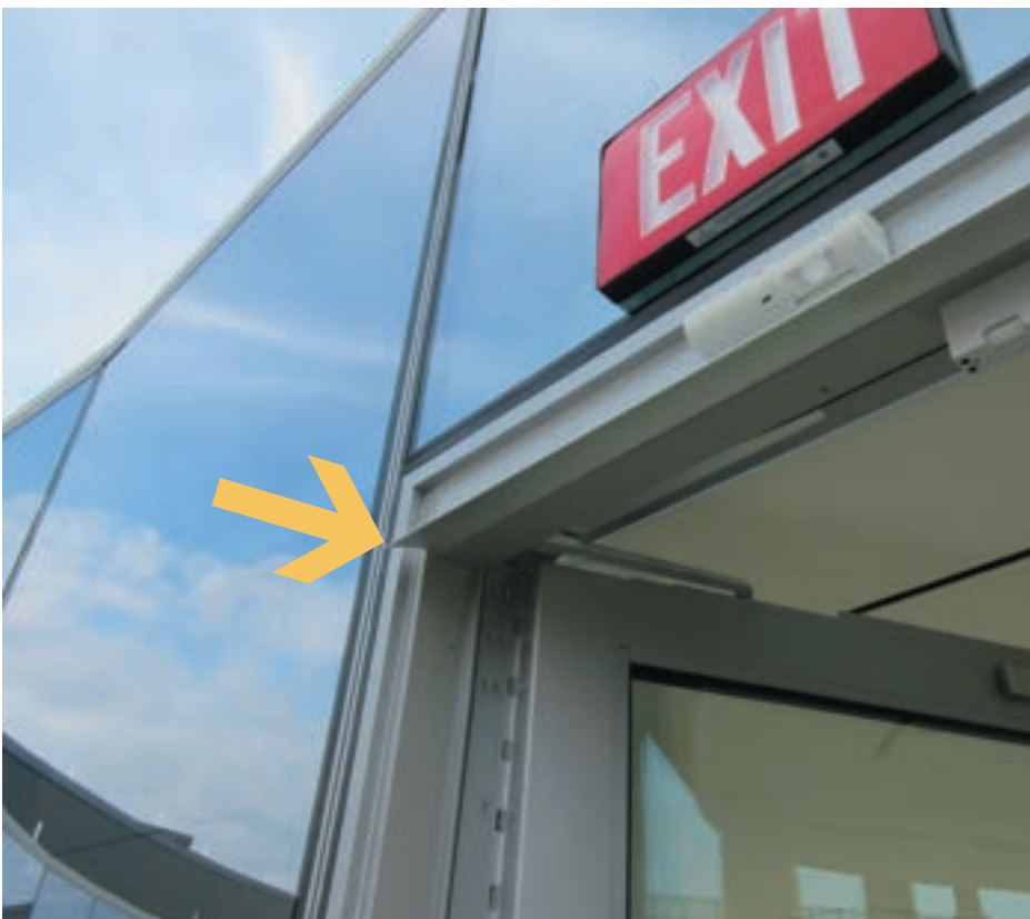
Figure 10. Drip edge installed at the head of a doorframe located at a roof-level terrace.

help drain water that could potentially accumulate against the threshold. The trench drains will generally require heel-proofgrates. Trench drains can be installed at either the exterior (to limit ingress) or